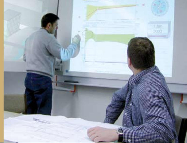
Hygrothermal component and room climate simulation