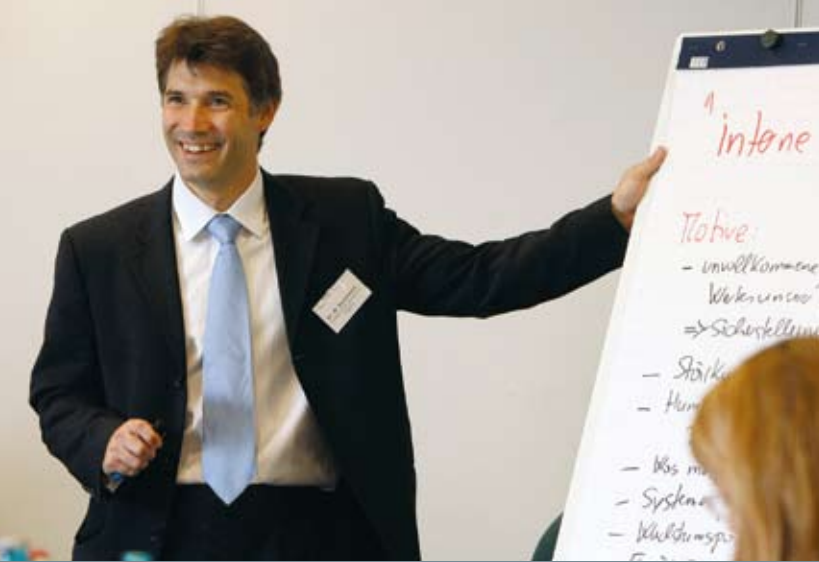
Knowledge Balance Sheet – Made in Germany

»The knowledge balance sheet is the strategic management tool of the future and enables companies to measure and develop their intellectual capital systematically and effectively.«